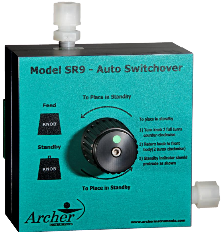
Shown above: SR9-10C