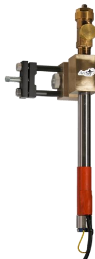
TCA-MONEL Ton Container Adapter