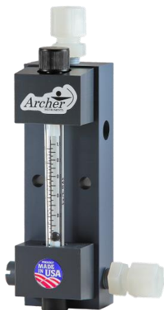
MPA-10X 3" Remote Meter Panel