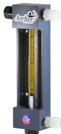
MPA6-10X 6" Remote Meter Panel